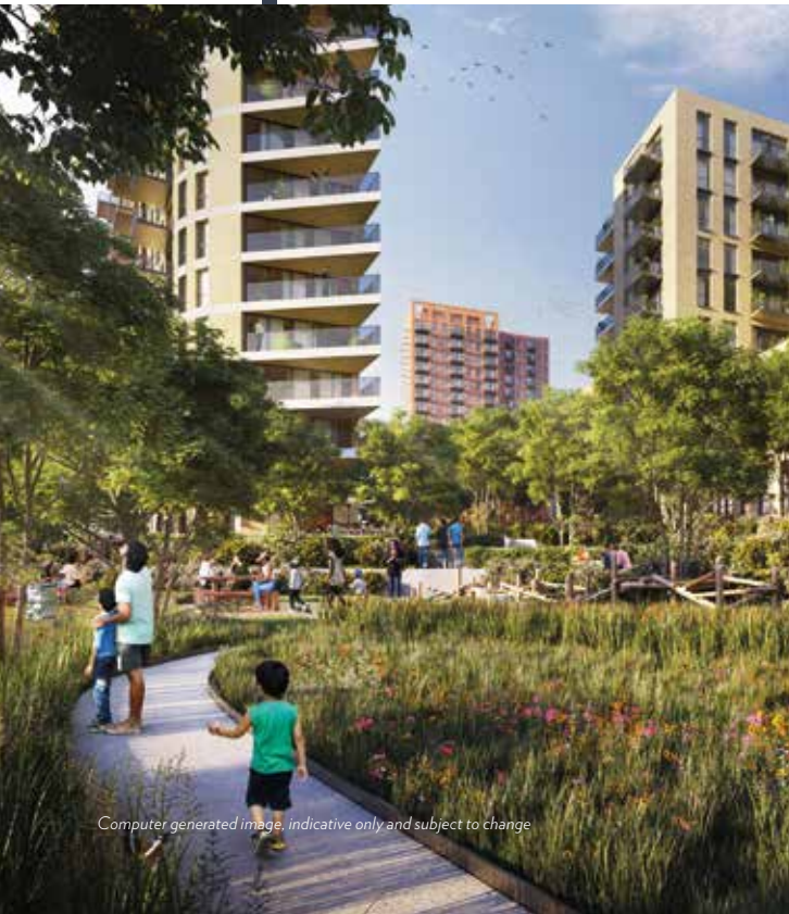
Computer generated image, indicative only and subject to change

Journey times from Grand Union Train times from Stonebridge Park (SP) ZONE 3 or Alpertton(A) ZONE 4