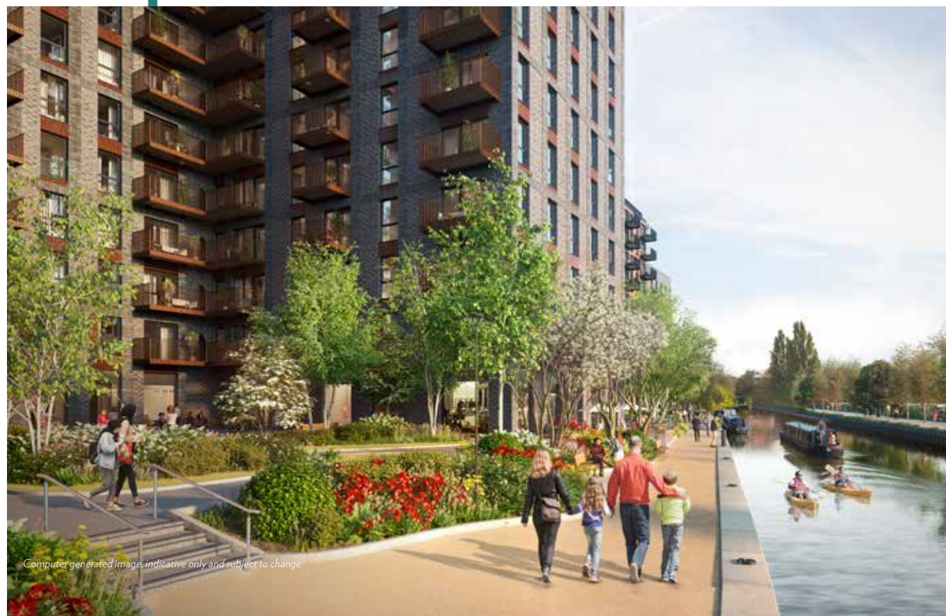
Computer generated image, indicative only and subject to change