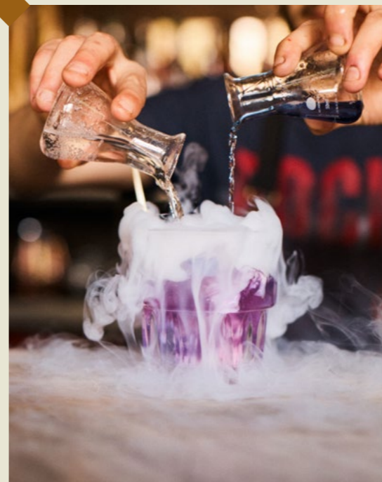
Enjoy a zingy cocktail at The Alchemist