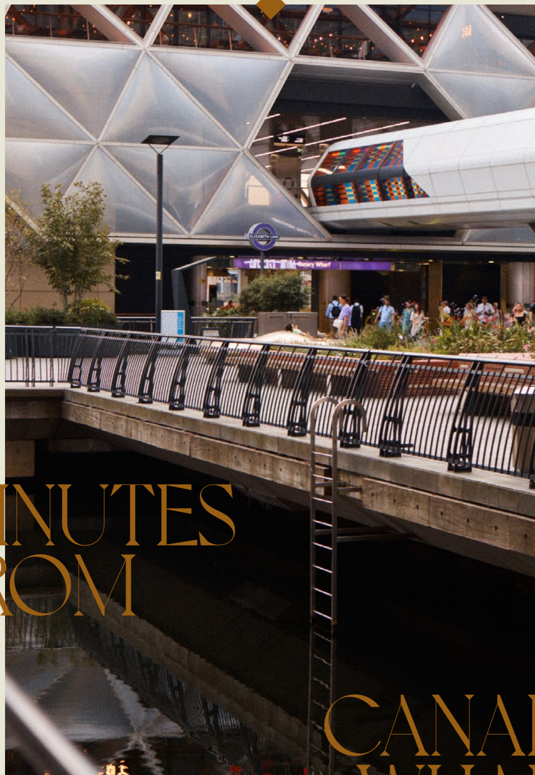
CROSSRAIL PLACE Canary Wharf's iconic Elizabeth line station

Zip along the Elizabeth line to reach London's leading financial district in 3-minutes . Or take a short stroll along the riverside.